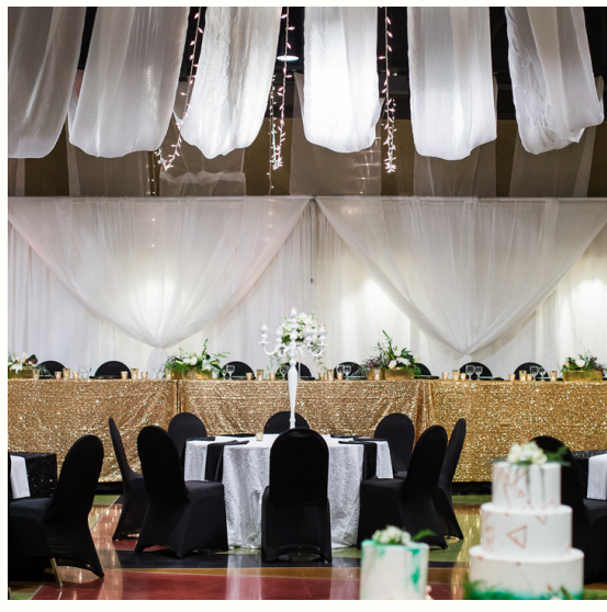
Additional Services available.